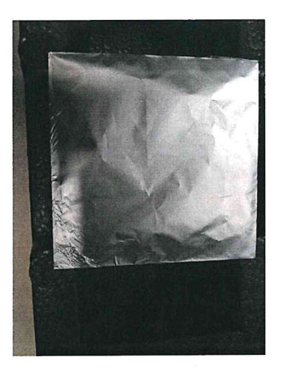
Figure: Coated glass plate from Figure 1 after sublimation of the product